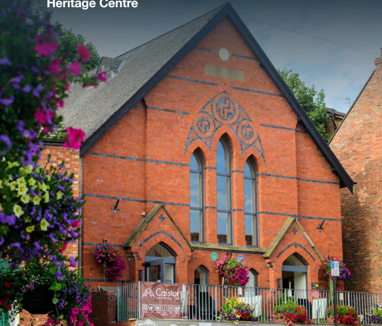
Caistor Arts and Heritage Centre