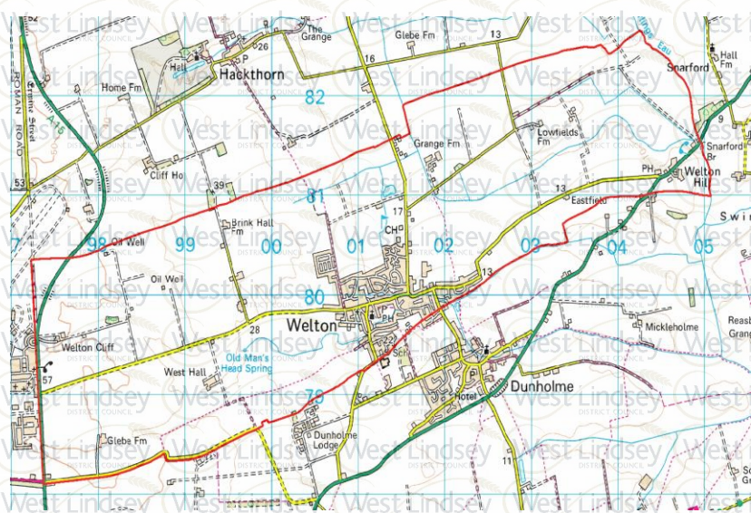
Fig 1.2 The area covered by the Neighbourhood Plan