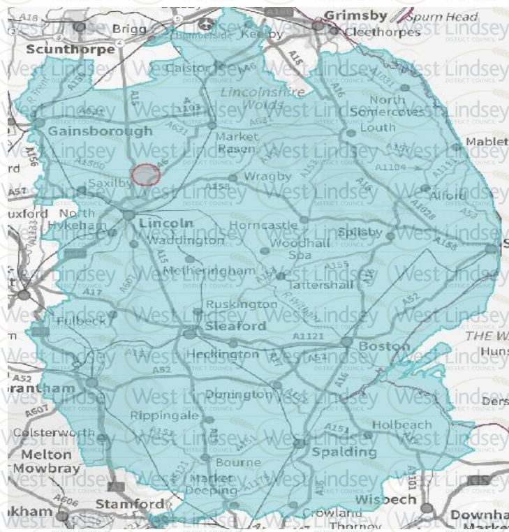
Fig 1.1 Welton-by-Lincoln in Context

Due to the failure of the Central Lincolnshire Joint Plan being officially adopted, the number of houses and employment space is unknown.