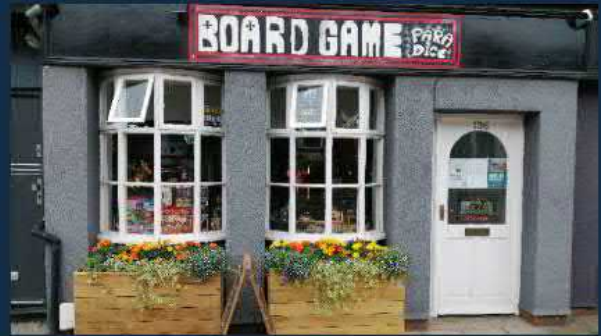
BoardGame ParaDice, Gainsborough

Collecting the honey and looking after the bees and beehives provides many health and wellbeing benefits, both to those working on the site and customers who choose to by it.