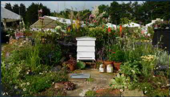
Waltham Herbs Willow Vale Nursery, Caistor

Currently we have supported 144 businesses with a total of £619,185, with several applications pending. Businesses have been supported in a wide range of recovery / growth initiatives including: