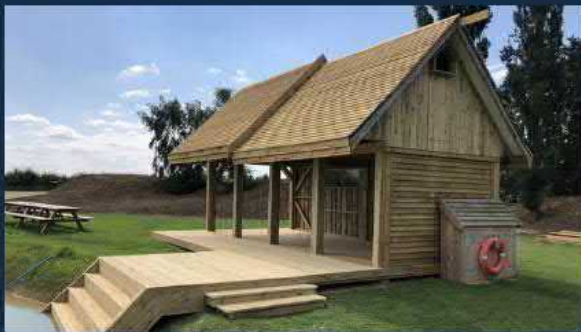
Glentham Grange, Glentham

The outside lighting at the rear of the property has been converted to low energy lighting, reducing the carbon footprint of the building. The landmark clock at the front of the building has been restored to working order, with the internal lighting again converted to carbon reducing low energy lighting. The hope is that the funding, along with hard work, will benefit the local area, and may even encourage other people to bring one of the main roads in Gainsborough into a safe and attractive area.