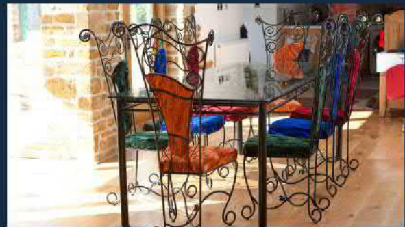
Gainsborough Forge, Marton

They have also incorporated a barn owl flight within the enclosed roof space which is already providing hunting roosts for the resident barn owls.