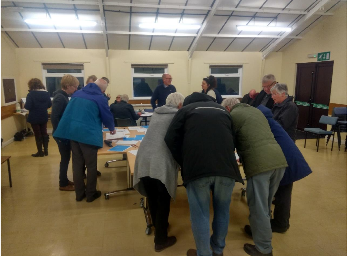
Regulation 14 consultation events