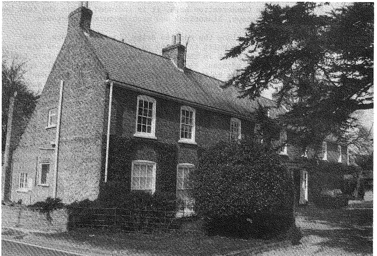
"...Pimlico Farm...closes the view from the village" para 42