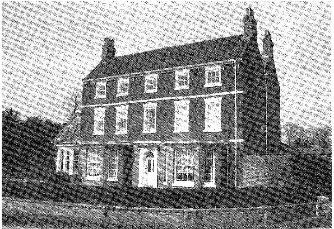
"Boundary Farmhouse...a Listed Building built in 1773..." para 44