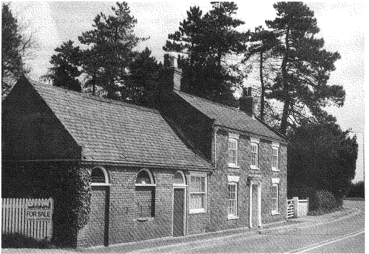
"Town End House retains its (late eighteenth) style unaltered" para 36