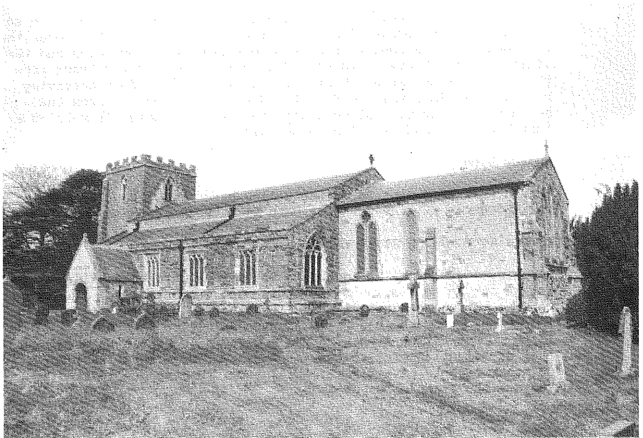
"...the Parish Church of St Peter...with attendant trees" para 49