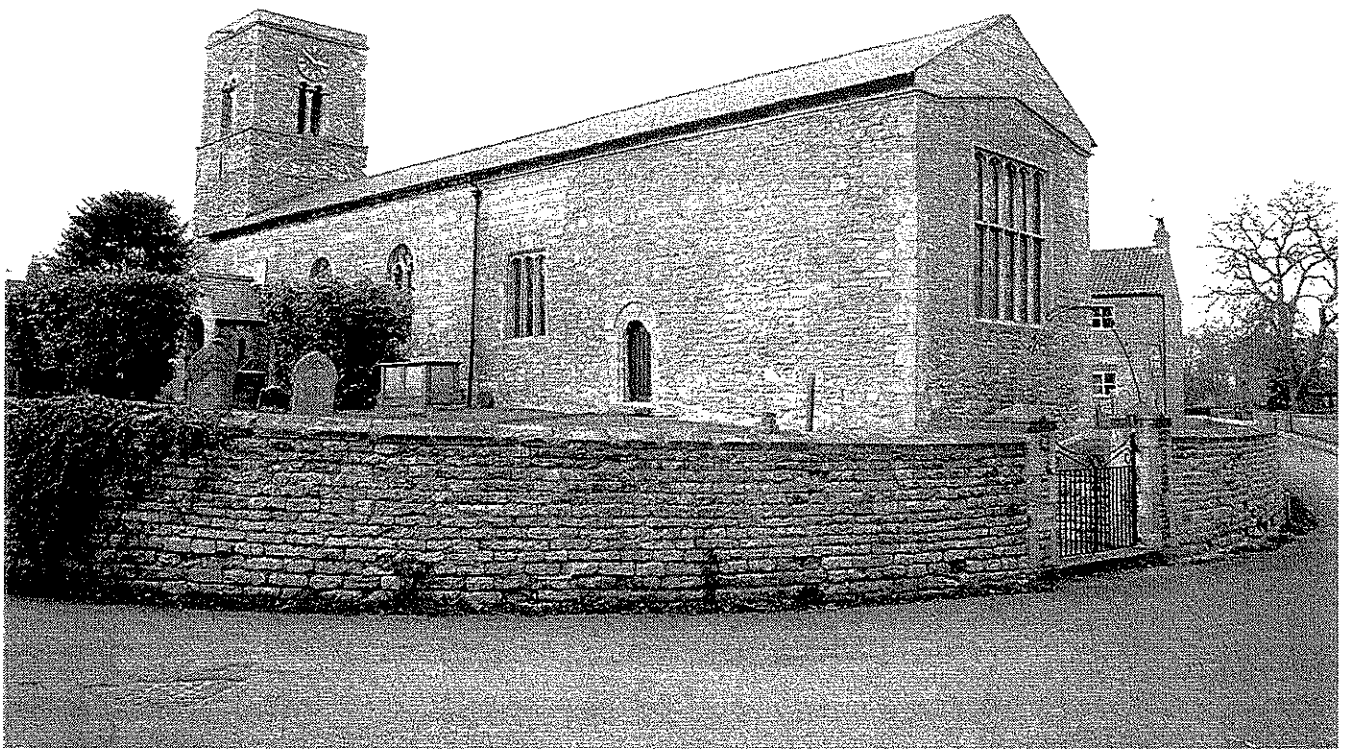
"St Michael's Church, a grade II* Listed Building is a superb late C11 Church" Para 59