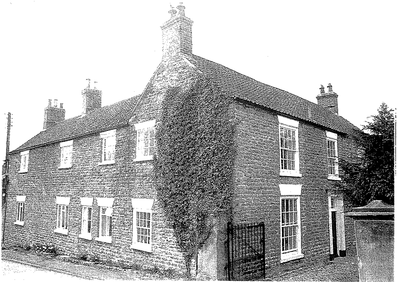
"Scottish Farmhouse, a fine Grade II Listed C18 stone building" Para 42

"...the red brick farmbuildings provide a sense of informality which lends character to...the village." Para 43