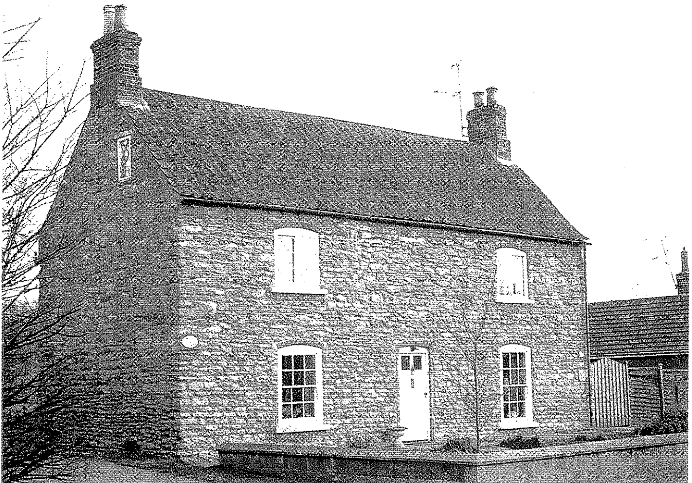
"...12 Church Street...an attractive late C18 coursed ironstone rubble house" Para 67