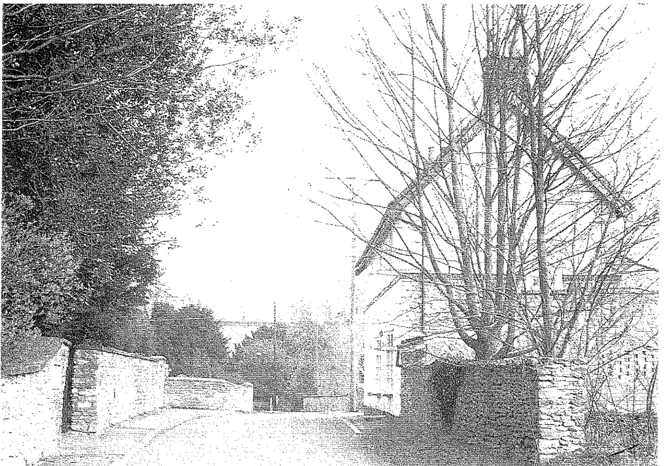
"The stone walls along both sides of Church Street are visually attractive" Para 62