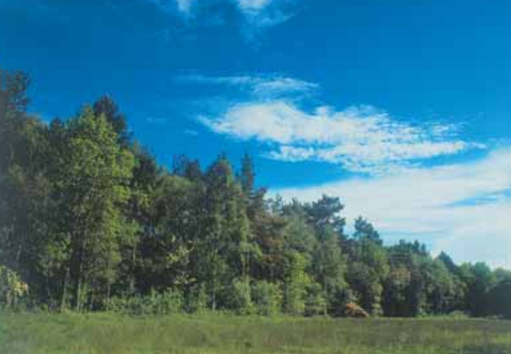
Chambers Farm Wood, Wragby ▲