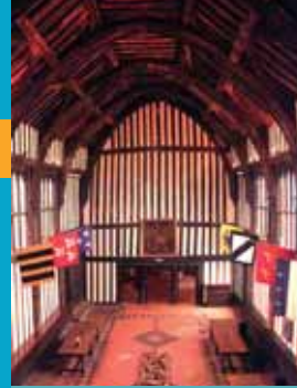
Gainsborough Old Hall