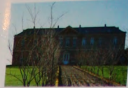
Wish you were here 2036....

Create your vision...using a Gwentworth "Wish you were here 2036...." postcard.